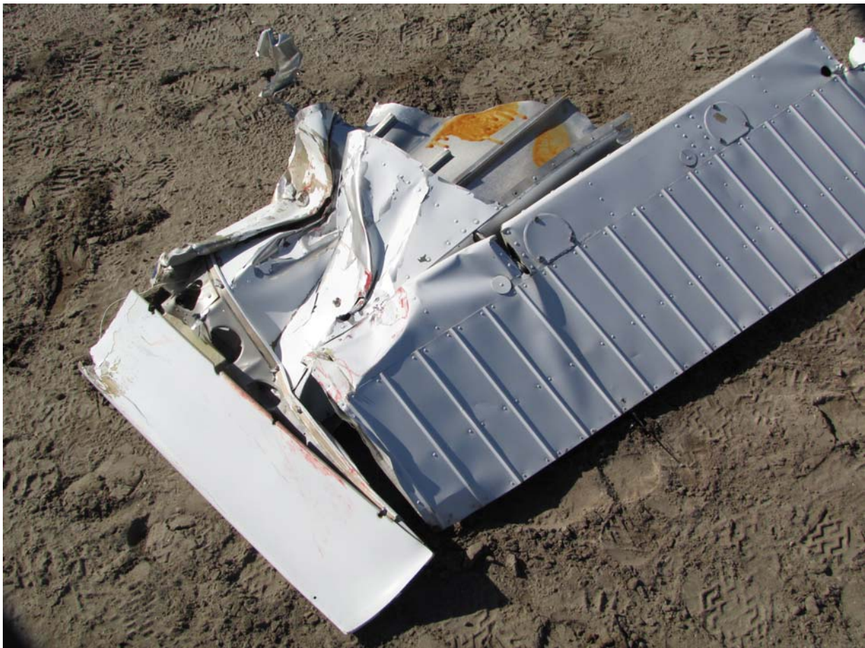
Figure 2: Damage to Right Wing tip and Aileron.