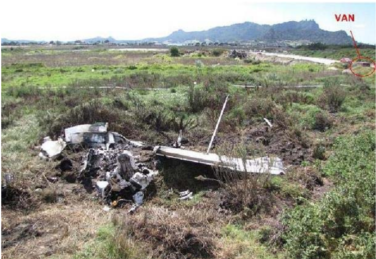
Figure 1: Main Wreckage.

1.12.3 Both of the wings, the engine and the propeller had separated from the fuselage during the impact sequence. The centre fuselage had been consumed by an intense fire (see Figure 1).