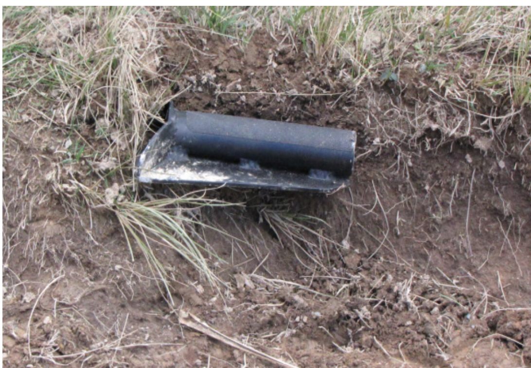
Figure 3. Snow shoe, demonstrating contact with edge of landing site.