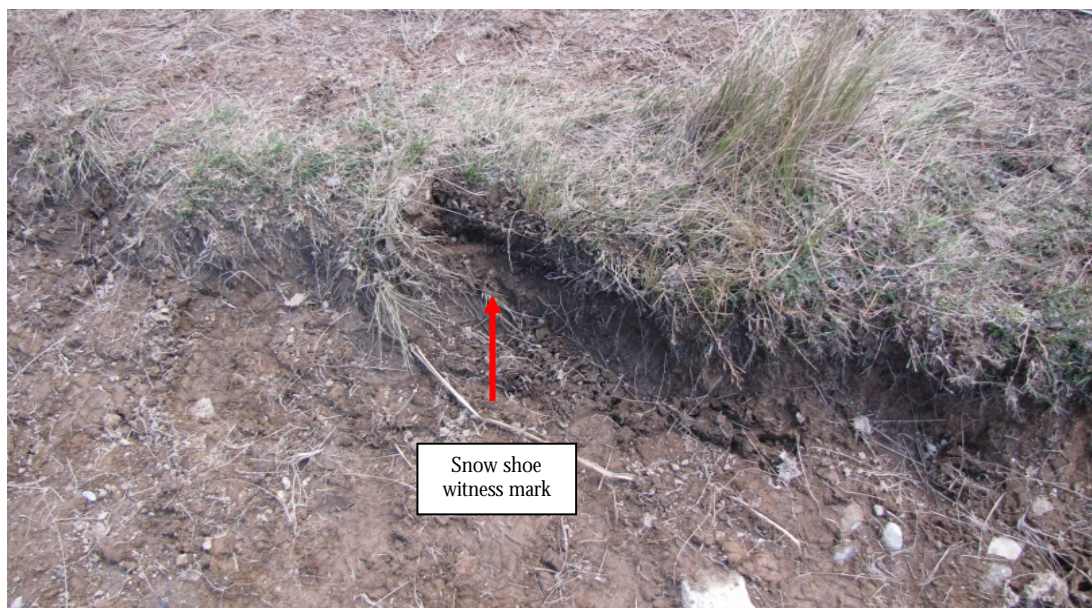
Figure 2. Witness mark from left hand snow shoe.